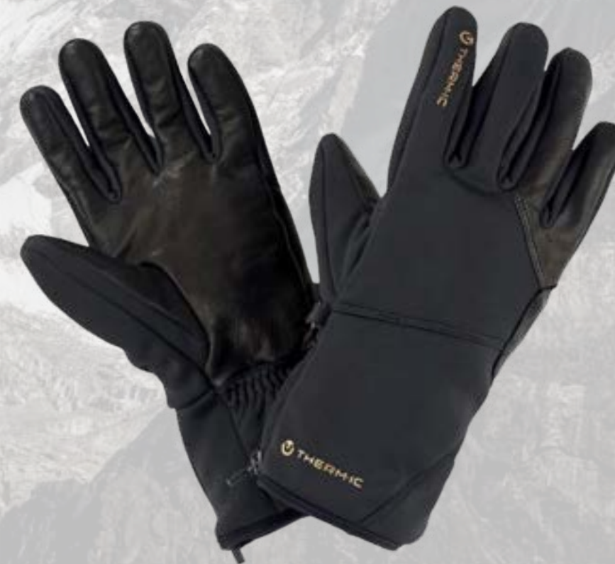
Therm-1c Ski Gloves Qty: 2

Built with light, stretchy and weather-resistant soft-shell fabric for high-output pursuits in mild conditions.