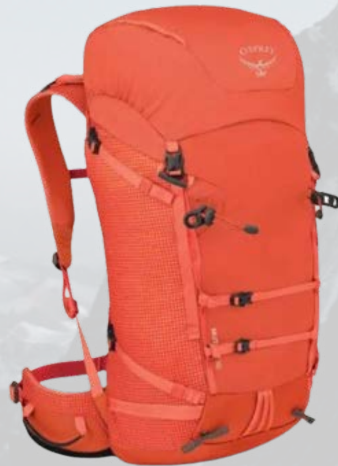
Mutant 38 Qty: 1