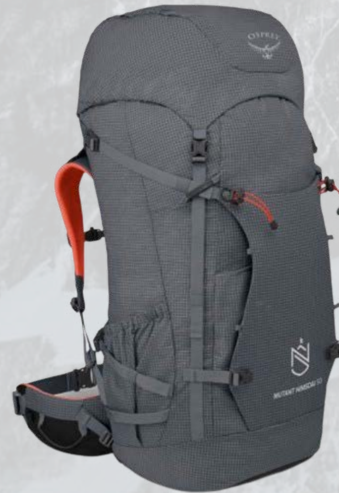
Nimsdai Mutant 90 [Not mandatory but nice to have] Qty: 1