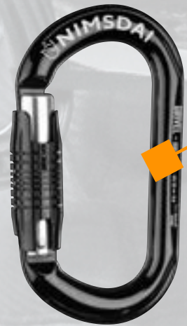
Nimsdai - K9T SYM twist lock