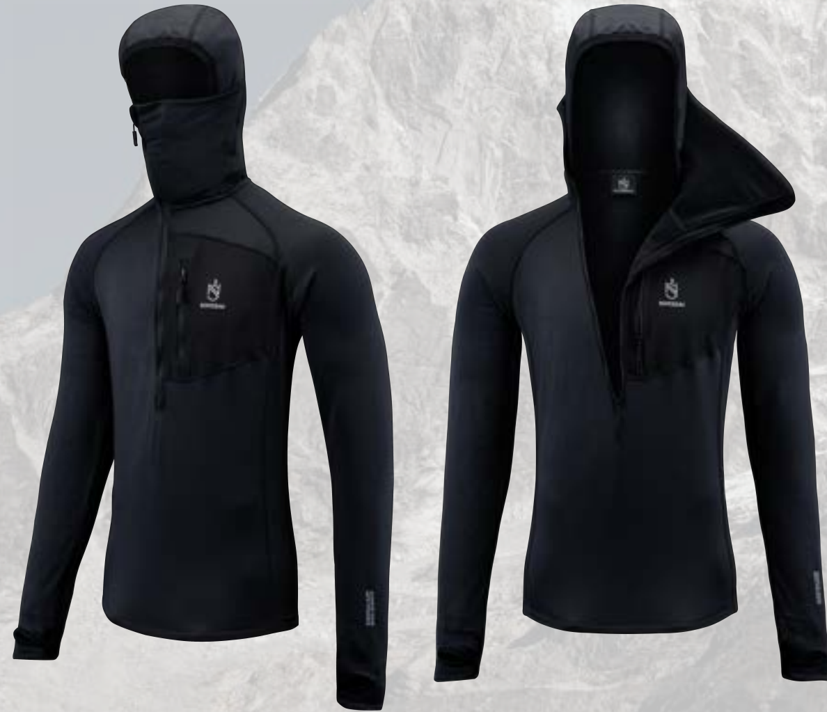
Nimsdai Base Layer

A piece of clothing worn under your other clothes, made of material that is designed to keep you warm and dry: When you are active in cold conditions, it is important that you wear a base layer that will draw sweat away from your body and keep you dry and warm.