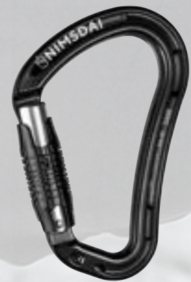
Nimsdai - K18T WIDE twist lock