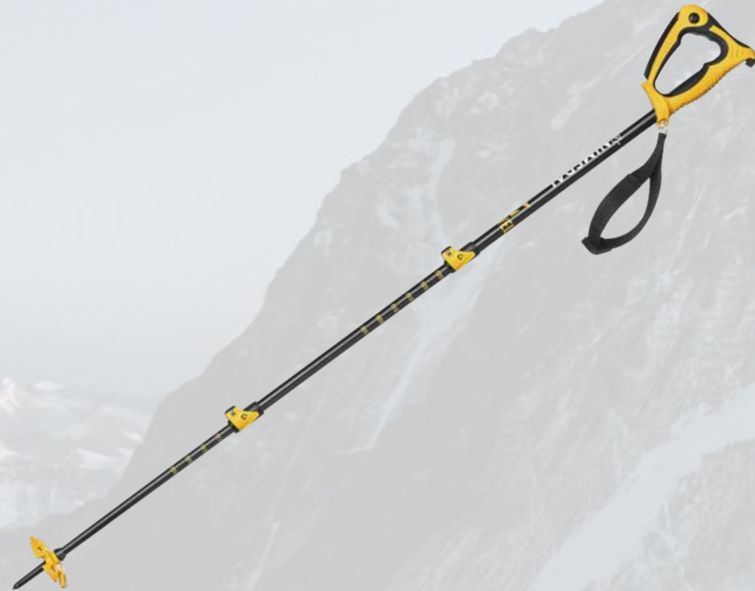
Nimsdai x Gravel Condor Pole

Trekking poles act as another set of limbs to give you more stability when tackling tricky terrain