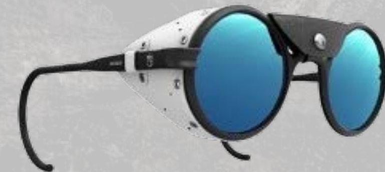
Vallon - Heron Glacier Nimsdai