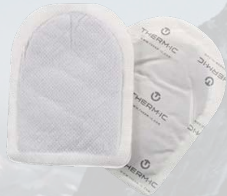
Therm-Ic Toe Warmer

Hands warmers and toe warmer are single use air-activated heat packs that provide warmth and are ideal for keeping your body warm when temperatures drop.