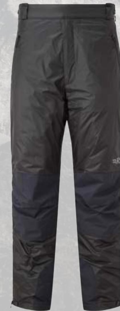
Rab Down Trouser

Insulated Down Pants to keep your lower body warm and keep the snow, water, and slush away from your inner layers.