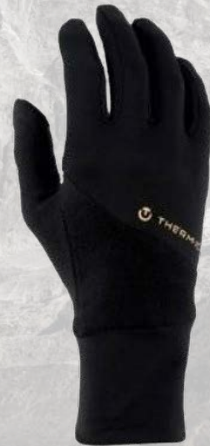
Therm-1c Warm Lightweight Gloves Qty: 3

Liners gloves are thin gloves that are usually worn inside other mitts or gloves to provide an extra layer of protection, absorb sweat and increase warmth.