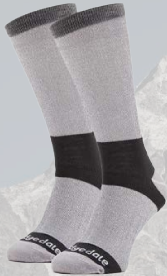
Bridgedale Liner Socks

Its incredible important to look after yourself whilst on the exped, having clean socks will ensure your feet & Skin will be in the best possible shape to continue your journey.