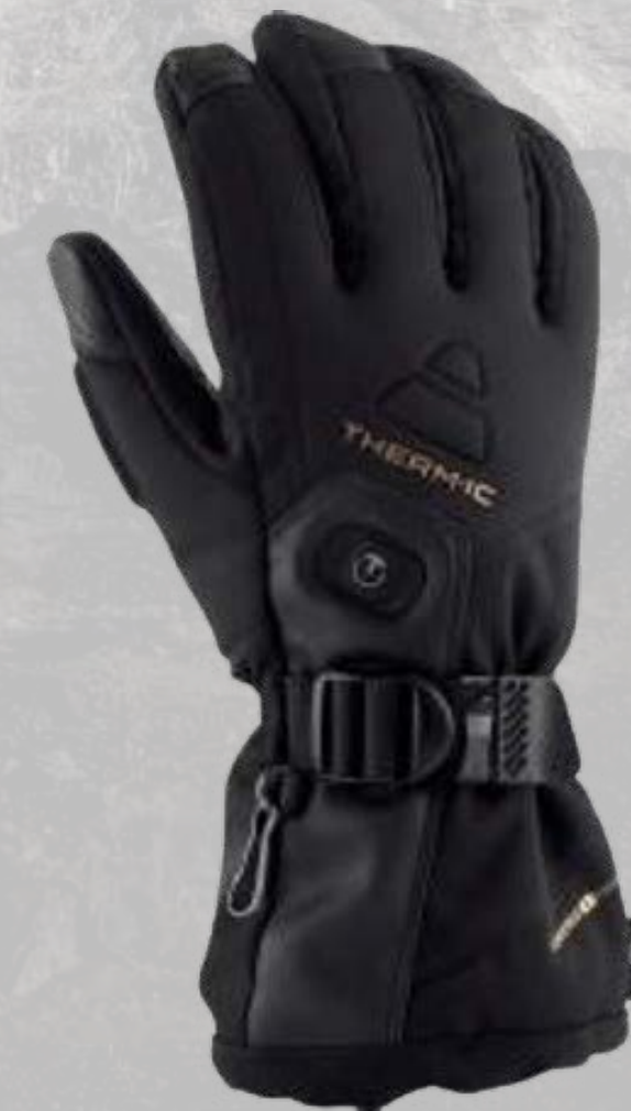
Therm-1c Ultra Heat Boost Gloves Qty: 2

The warm, waterproof Expedition mittens keep your fingers toasty on frigid winter mornings and climbs at high elevations.