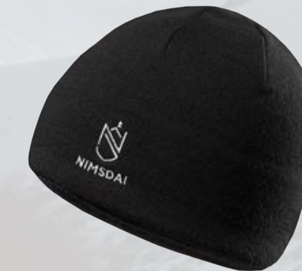
Nimsdai Beanie Qty: 2 [You always need a spare]