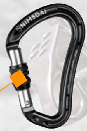
Nimsdai - K18N WIDE screw lock

Created with climbers and mountaineers in mind, its larger size and shape facilitate rope manoeuvres, allowing knots and extra ropes to pass through easily.