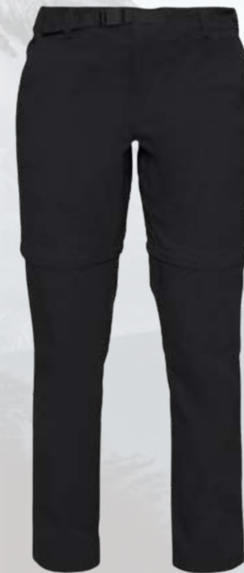
North Face – Paramount Convertible Mid Rise Pant

Lightweight and breathable, making them ideal for trekking.