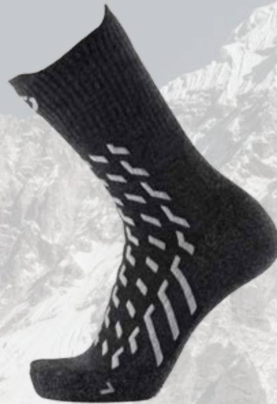
Thermic Trekking Socks