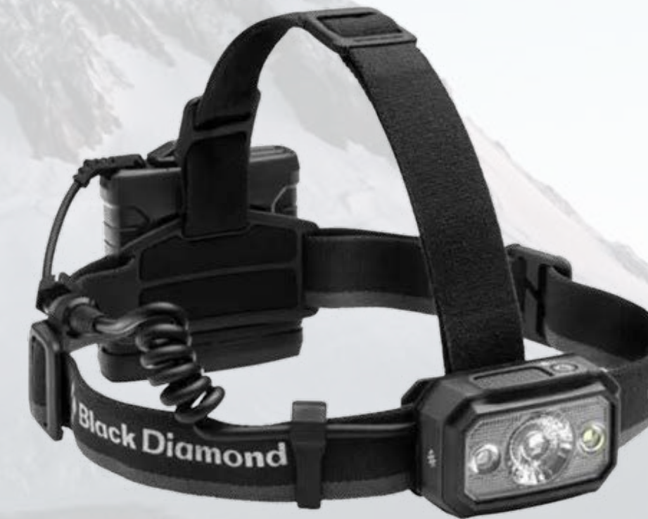
Black Diamond Icon Headlamp

A head torch or headlight is a light source affixed to the head for outdoor activities at night or in dark conditions such as hiking, camping, mountaineering, etc. [With extra batteries].