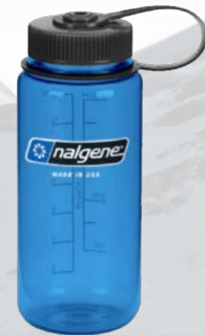
16oz Water Bottle Qty: 1