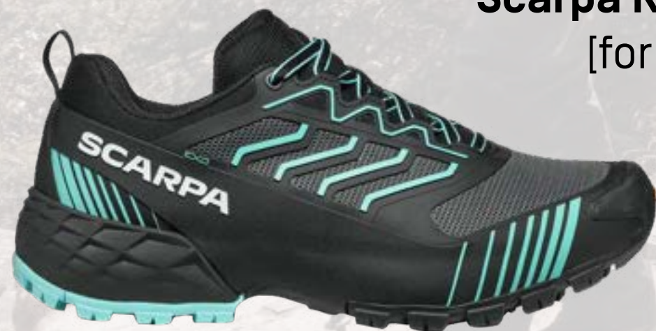
Scarpa Ribelle Run XT [for Women]

The Scarpa Rusk Trk LT is a lightweight ripstop fabric hiking boot, featuring water-resistant suede uppers with breathable mesh zones and a GORE-TEX® Extended Comfort membrane for additional wet weather protection. This makes the Rusk Trk suited to year-round hiking in both warm and cold temperatures, from dry to wet weather.