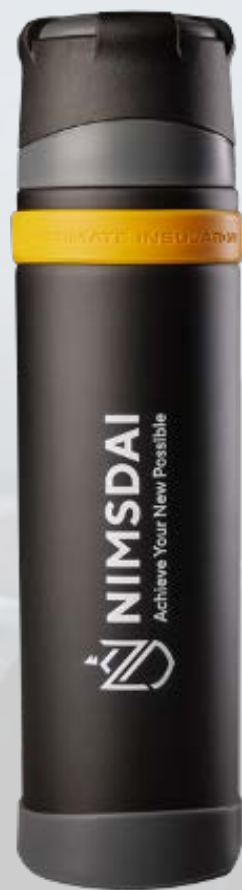
Nimsdai - Thermos Flask Qty: 1

It is recommended to carry at least one of each item of the following. 32oz water bottle, insulated water bottles and another wide mouth water bottle.