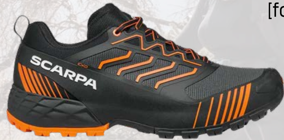
Scarpa Ribelle Run XT [for Men]

Equipped with a breathable mesh, PU and TPU upper, this model envelops the foot and provides stability and protection.