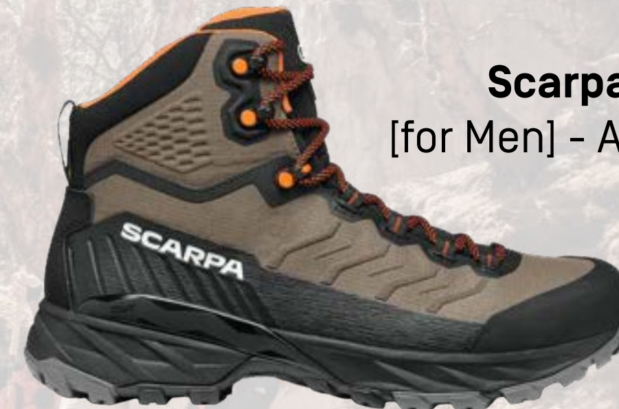
Scarpa RUSH TRK LT GTX [for Men] - Available in other colours

The Scarpa Rusk Trk LT is a lightweight ripstop fabric hiking boot, featuring water-resistant suede uppers with breathable mesh zones and a GORE-TEX® Extended Comfort membrane for additional wet weather protection. This makes the Rusk Trk suited to year-round hiking in both warm and cold temperatures, from dry to wet weather.