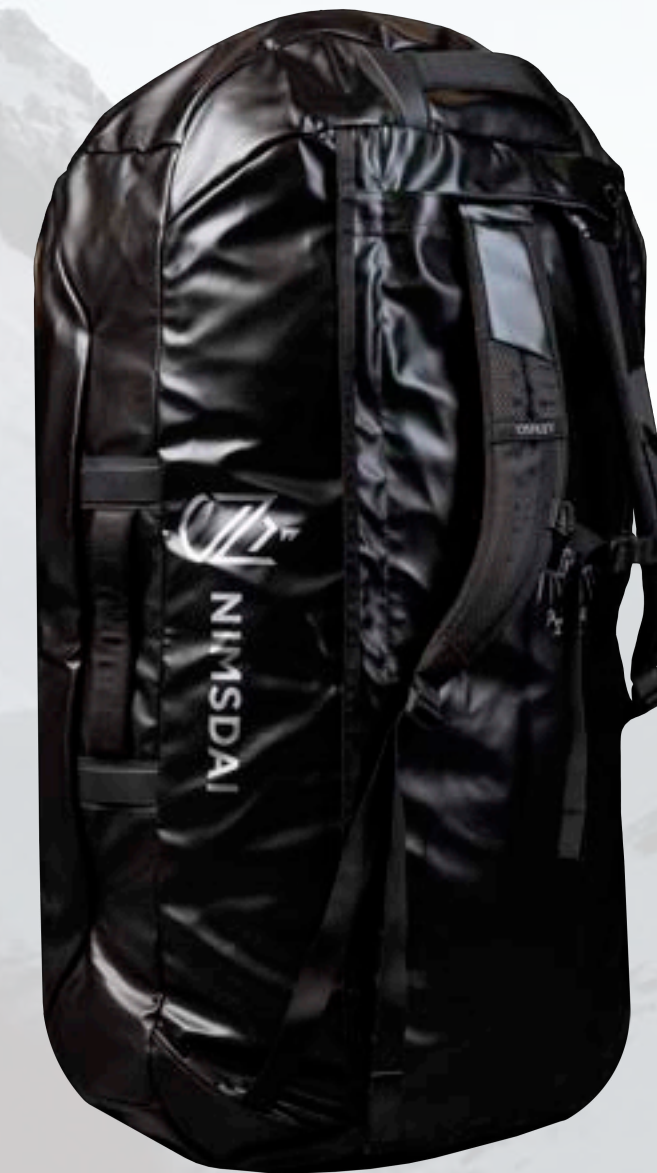
Nimsdai Duffle Bag Qty: 2 [With locks as well]