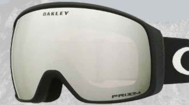
Flight Tracker L Snow Goggles

Sunglasses are indispensable for any outdoor activity. The main purpose of UV protected sunglasses while trekking and mountaineering is to protect your eyes from the harmful UV radiation coming directly from the sun and from reflected rays.