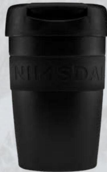
Nimsdai - Coffee Mug [Optional] This is a nice to have item but not essential Qty: 1