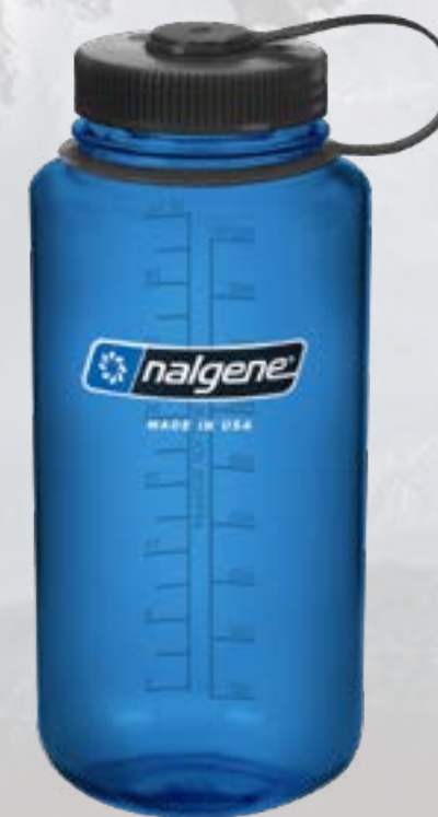
32oz Water Bottle Qty: 1