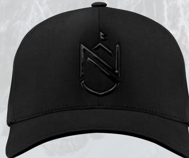
Nimsdai Delta Cap

To shade your face / neck from the sun on a hot day.