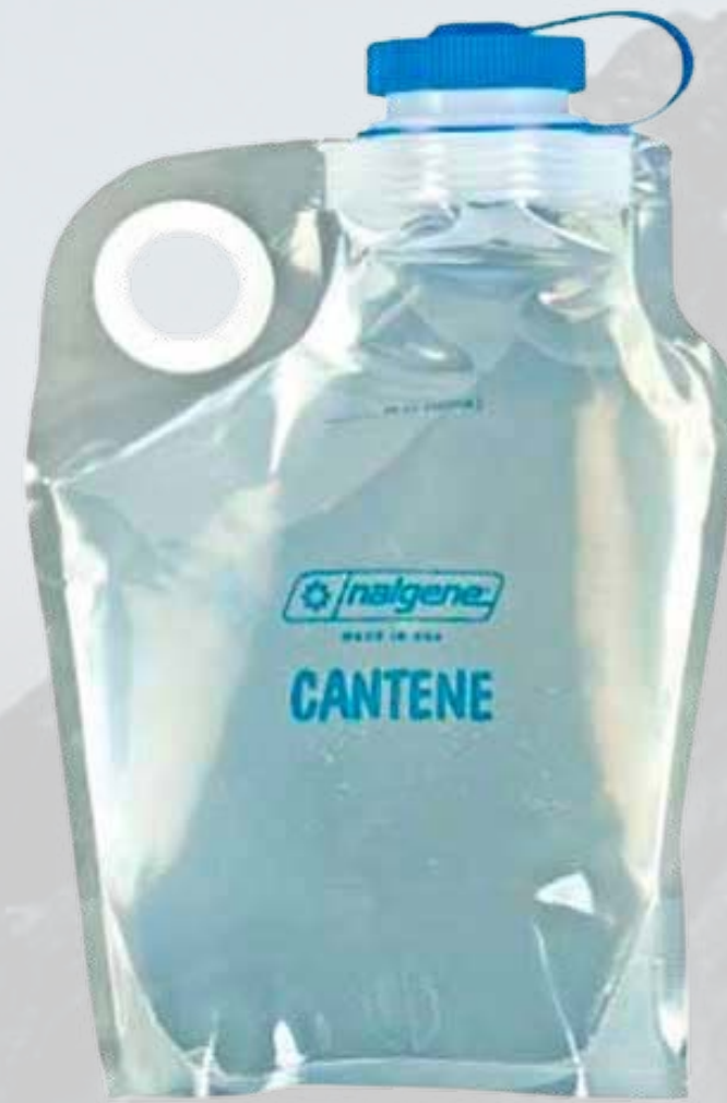
Nalgene PE Folding Bottle