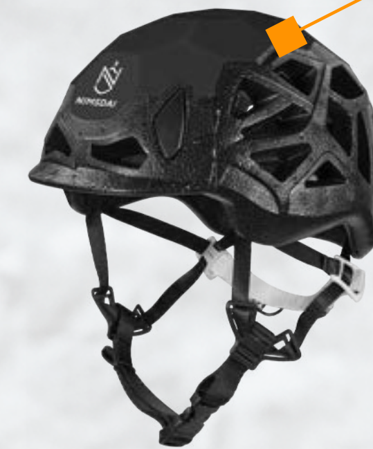
Nimsdai - Mutant Helmet

It features an innovative design with a symmetric hexagon-covered top and a different pattern left to right. This combination of technologies allows a low weight with good all-round protection (on the top and sides) and good ventilation.