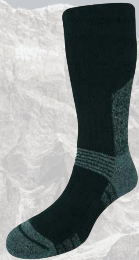
Bridgedale Summit Socks