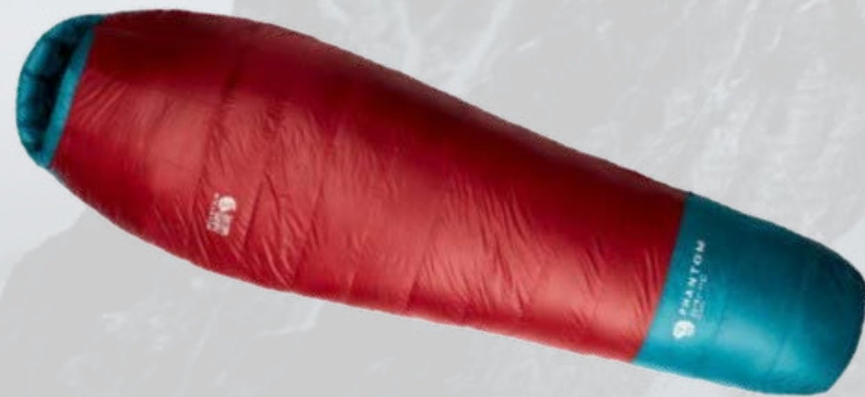
Mountain Hardware - Sleeping Bag

A sleeping bag rated at -40 for the entire exped is needed. It is nice to have 2 for ease when on rotations to and from base camp to the higher camps, but 1 is manageable.