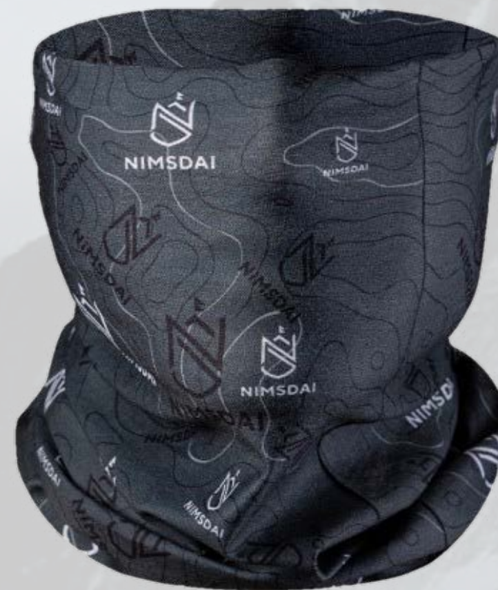
Nimsdai Neck Warmer Qty: 3 [Required for each mountain]

The proper use of buff protects you from the Frostbite in your face.