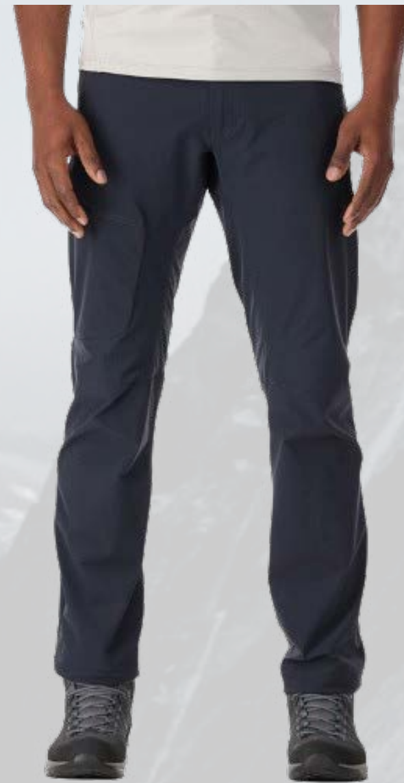
Rab Incline Pants

Soft-shell pants are made of high-performance synthetic fabrics that are resistant to abrasions & tears. They are typically water-resistant (not waterproof) which means they are breathable and shed light rain and snow and dry quickly when they get wets.