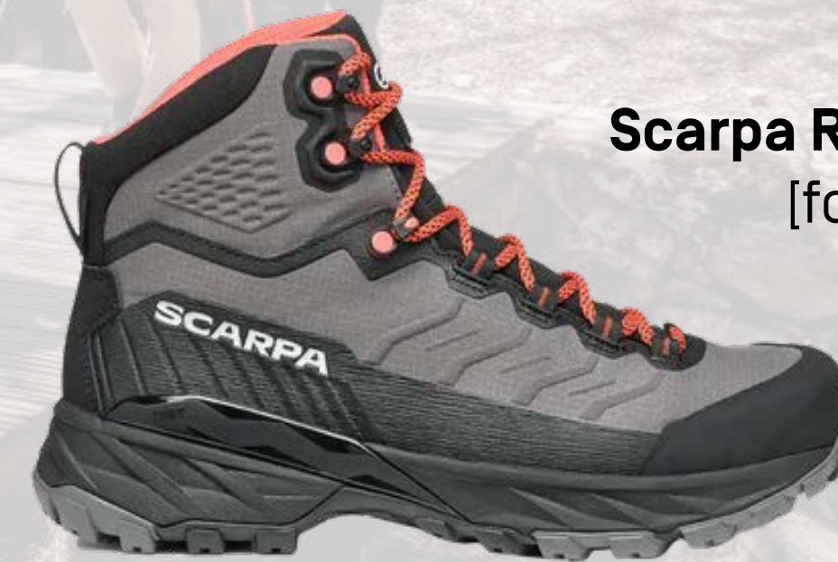
Scarpa RUSH TRK LT GTX [for Women]

Click the images to be redirected to the webpage*