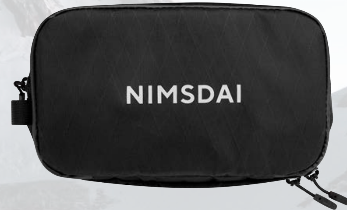
Nimsdai - Everyday Utility bag

Nice to have to keep your essentials safe and dry